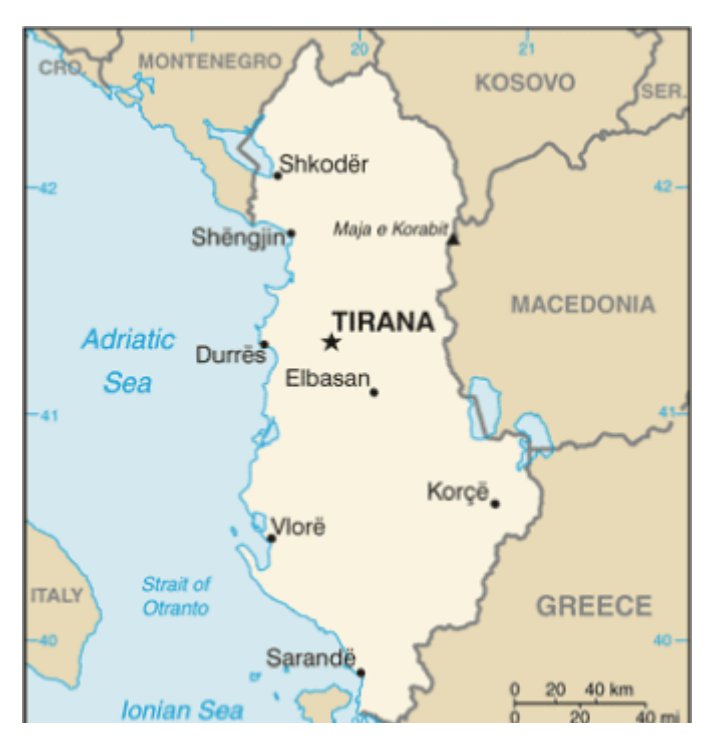
Figure 1: Albania's geographical location.

Albania is a parliamentary democracy and qualifies as a transition economy as it is moving from a central, state-planned economy to a free market economy. The country is a member of the United Nations, NATO, Council of Europe and the World Trade Organization. Since January 2003 it is a potential candidate for accession to the EU and on 28 April 2009 it officially applied for EU membership.