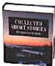
1 short stories