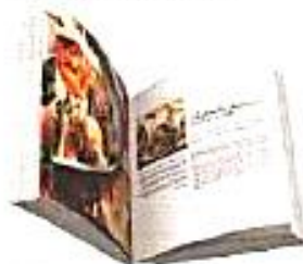
7 cookery book