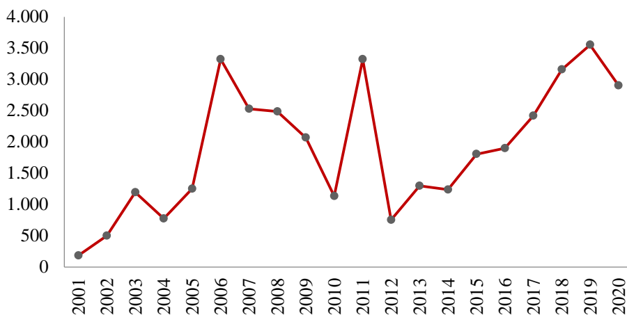
Figure 2. FDI of Serbia in millions of euros from 2001 to 2020

numerous factors, such as the transition processes, the World Economic Crisis, and the political situation. The lowest level of FDI was 184 million euros in 2001, while the highest level was 3,551 million euros in 2019. Figure 2 shows a rising trend in FDI inflows from 2014 to 2019, attributed to Serbia's growing appeal as a particularly favorable investment location for foreign investors.